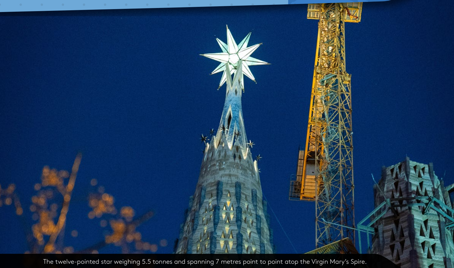
The twelve-pointed star weighing 5.5 tonnes and spanning 7 metres point to point atop the Virgin Mary's Spire.